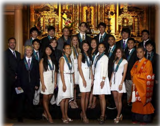
Baccalaureate Service at Honpa Hongwanji Hawaii Betsuin on May 8, 2014