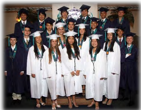
Commencement Exercises at Japanese Cultural Center of Hawaii on May 9, 2014