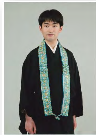
OHTANI Kojun Monshu Jodo Shinshu Hongwanji-ha