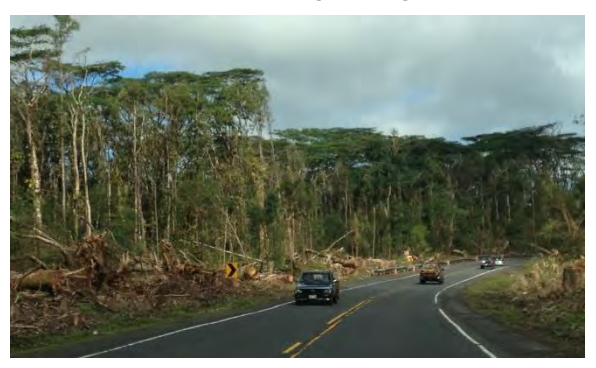
This picture was taken by Bishop Matsumoto when he visited the disaster-stricken area on Big Island.