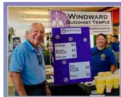
A still photo from a pre-COVID event used for Online Bon Dance Experience 2020.

It's that time of the year again! O-Bon Season is here, but unfortunately, we will not be able to experience the traditional Bon Dance as we know it, once again. Although, it cannot compare to an in person Bon Dance, Honpa Hongwanji Mission of Hawaii would like to present a new Online Bon Dance Experience for 2021. It will feature dances, a few easy recipes, and recollections and reflections by bon dance enthusiasts from across the state.