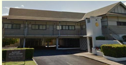
Buddhist Study Center (BSC) 1436 University Avenue Honolulu, HI 96822